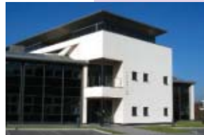
Hothouse... The Technium Centre at Swansea