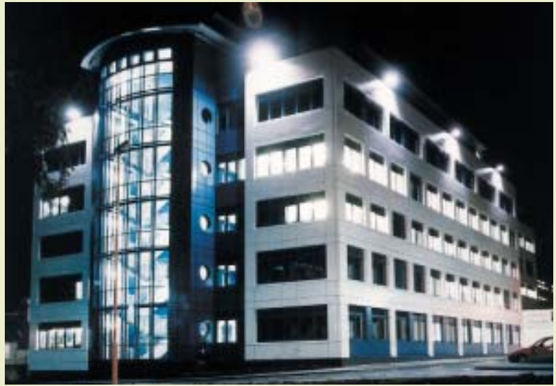
Concrete evidence... the Wellcome Trust Biocentre is a testament to Dundee's biomedical success