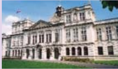
Impressive... Cardiff University's campus

A further 52 business proposals are now being considered, and approximately 30 projects will be approved and operational by the end of 2002. One,