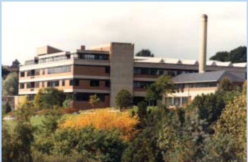
Powerhouse... the Harrison Engineering Building at Exeter University provides facilities for SMEs