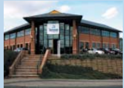
The University of Sunderland's Industry Centre

In the south west, where more than 80 per cent of businesses have fewer than 25 staff, a special centre at Exeter University's Harrison Engineering Building provides start-up companies with product development facilities such as advanced design simulation, rapid prototyping, remote testing, materials and electronics, many of which are beyond the means of smaller firms.