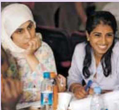
Fresh look... Docklands campus at the University of East London is a key player in widening participation

Students at the University of East London started Xor, one of the many new firms based at an incubator unit on campus. In conjunction with the British Council, Xor has created a learning management system to deliver global standards for e-learning, including a successful pilot scheme in India.