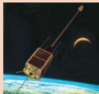
Reach for the stars... Surrey's space spinout has launched 20 satellites

teaching and consultancy services has been started. The university has established the SET Squared partnership with Southampton, Bristol and Bath to target entrepreneurs.