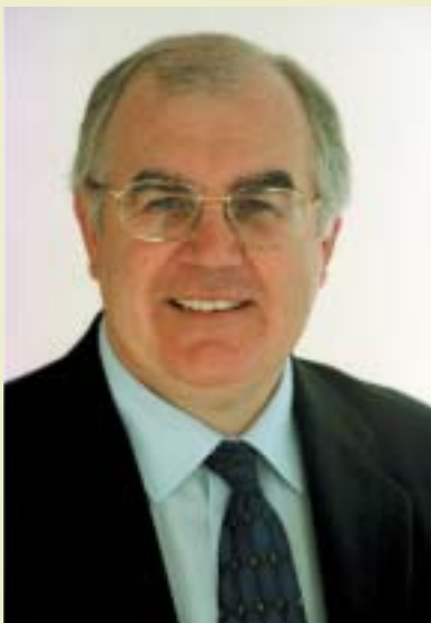
Commitment: Vice-Chancellor Sir Alan Langlands