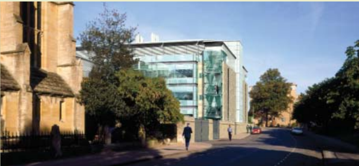
Investing in innovation... an illustration of Oxford University's new Chemistry Department building on South Parks Road