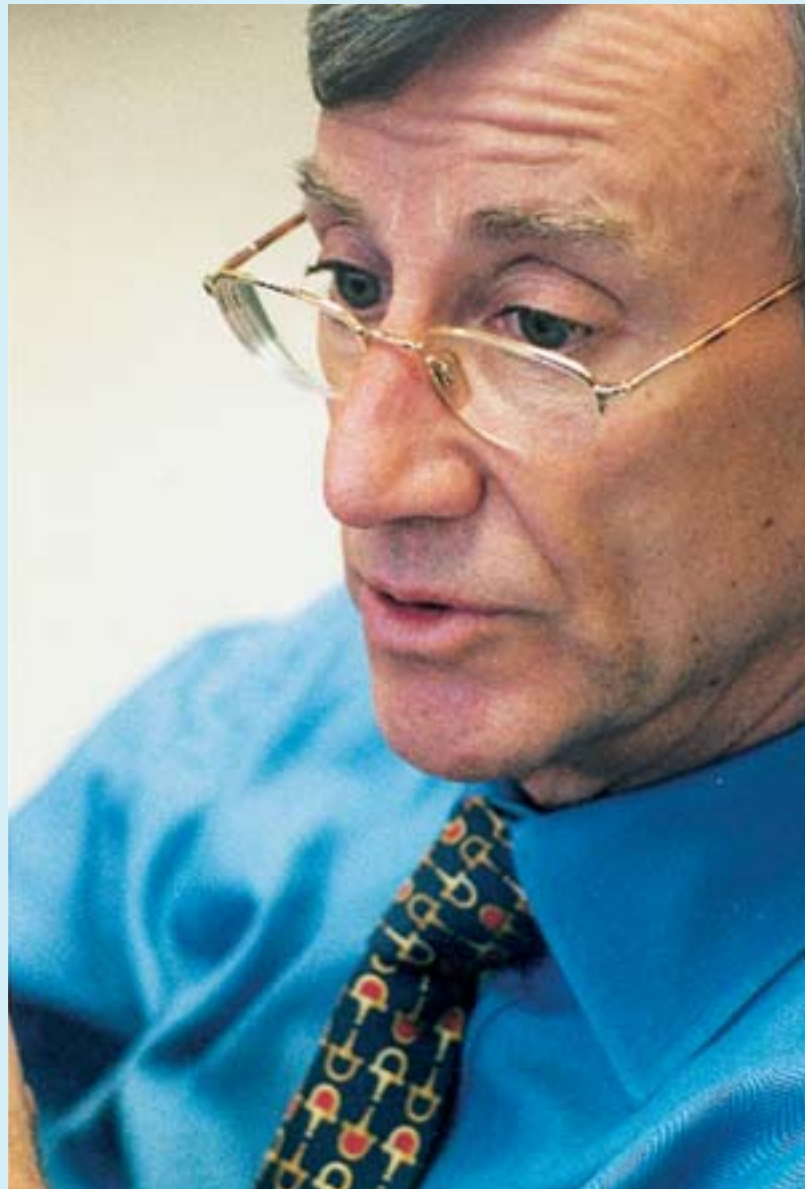
Serious about exploitation: Sir Richard Sykes believes technology transfer skills will be crucial

Such companies also educate their academic community about the issues surrounding intellectual property protection and the requirements for successful technology transfer, helping to develop the groundwork for a portfolio of commercial opportunities