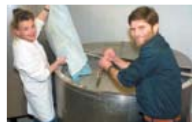
BrewLab: every student's dream come true