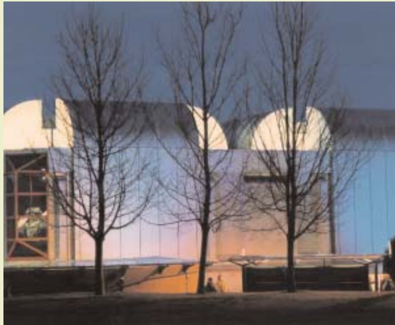
Art house... the University of Warwick's Art Centre is the biggest arts complex of its kind outside London, and has 250,000 patrons each year