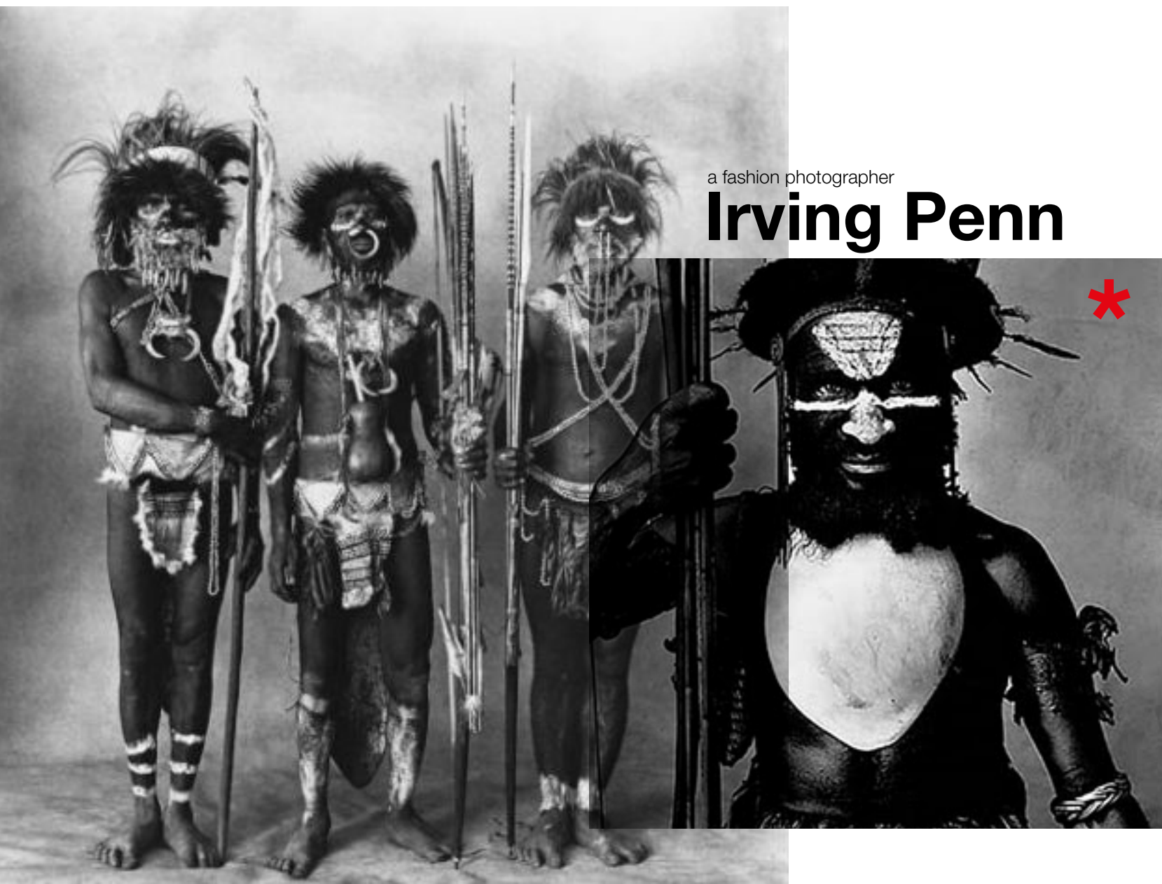
a fashion photographer Irving Penn